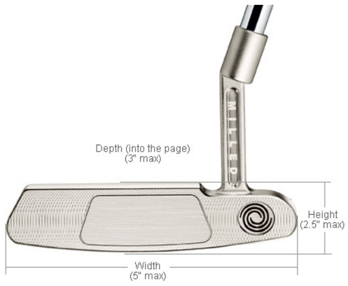
Figure 1. Dimensional constraints of putters.